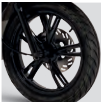
Large 16-inch wheels