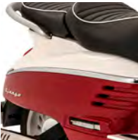
Chrome body panel trims