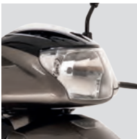
"Ice" effect LED light signature