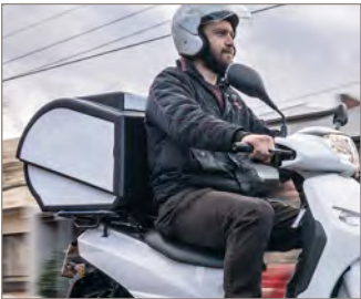
Tweet Pro comes standard with Cargo Carrier. Optional Delivery Box available. Tweet Pro is available in White Only.