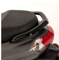
Passenger grab rails