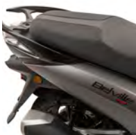
Passenger grab handle